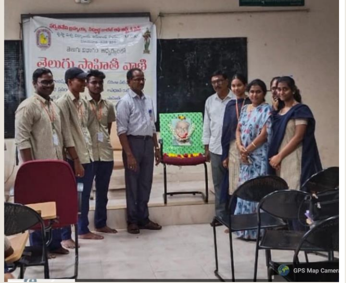
తెలుగుశాఖ ఆధ్వర్యంలో నేడు గుఱ్ఱం జాషువా వర్తంతి వేడుకలు ఈ క్లాస్ రూంలో జరిగిన వేడుకలు.